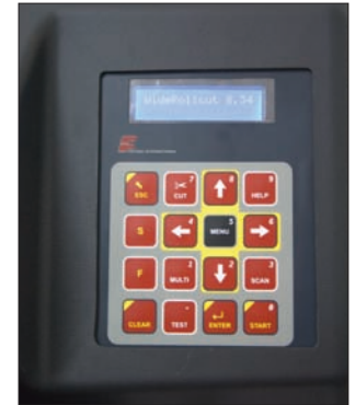
The new keyboard makes it easier to learn and operate