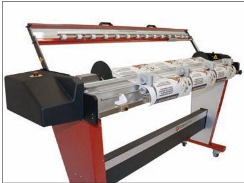
Very simple to load and operate

The WR64 can cut most flexible materials, as an option it can be equipped with an automatic side sensor, that will compensate for tapered or poorly wound rolls.