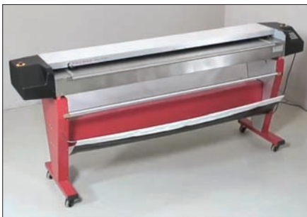
Very easy handling

Using this cutter is very easy and doesn't need a special training.